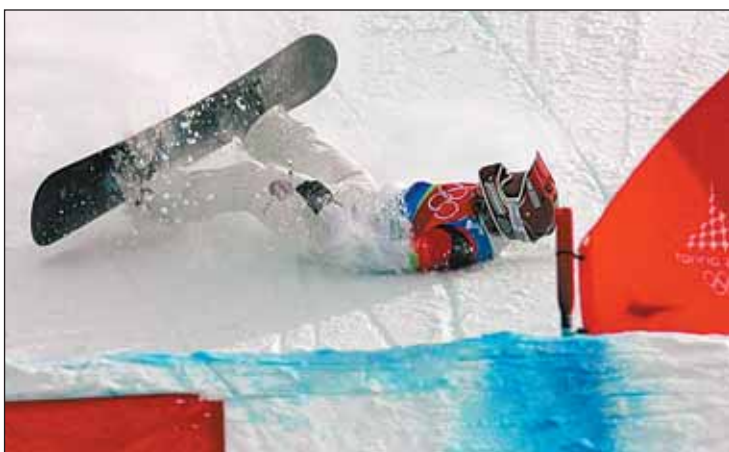
American Lindsey Jacobellis, who was leading in the final of the women's snowboardcross competition, crashes in sight of the finish at the Turin Winter Olympics in Bardonecchia, Italy, on Friday.