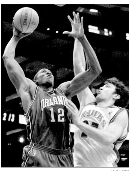
Orlando Magic forward Dwight Howard, left, goes to the net against Atlanta Hawks center Zaza Pachulia during the fourth quarter of their game Friday at Philips Arena in Atlanta.

Los Angeles improved to 11-10 on the road, surpassing its total of 10 road wins in each of the past two seasons. It also went 10 games over .500 (27-17) for the first time since 1991-92.