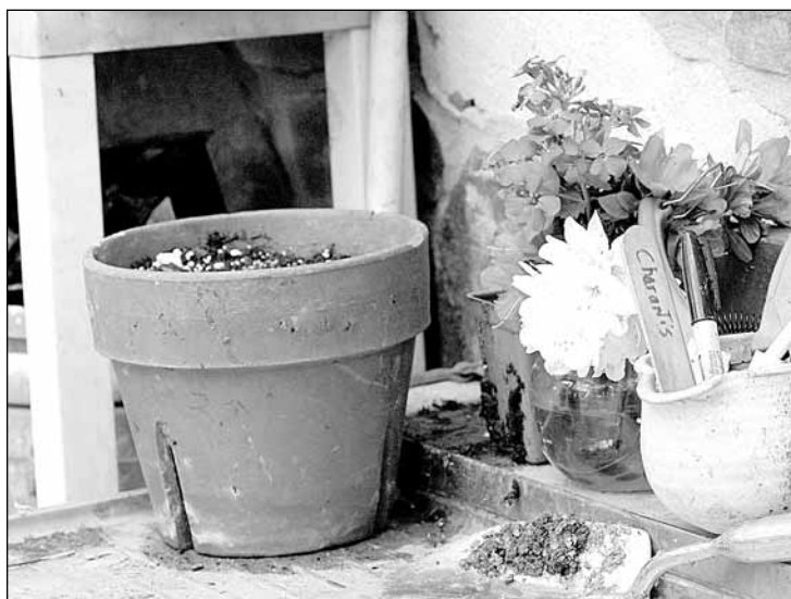
Nurseries have reported a decline in sales in the past few years. Fewer people are looking to gardening as a leisure activity.