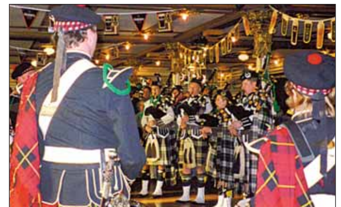
Bagpipers will entertain during Irish Fest on March 17 at The Rathskeller in Indianapolis. Festivities begin at 11 a.m.