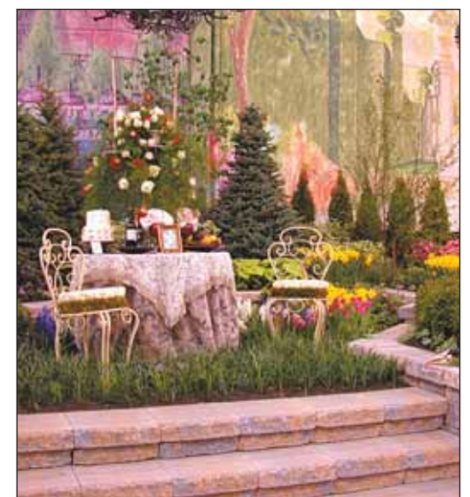
Spring will be in full bloom at the Indiana Flower and Patio Show through March 19 in Indianapolis.

The fairgrounds are at East 38th Street and Fall Creek Parkway in Indianapolis. Information: www.indianastatefair.com