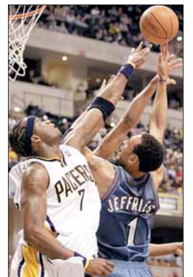
The Pacers' Jermaine O'Neal, left, blocks the shot of the Wizards' Jared Jeffries during the first quarter of Friday's game at Conoco Fieldhouse in Indianapolis.