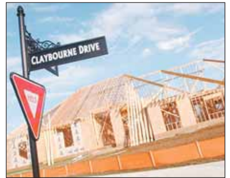
About 30,000 people are expected to tour homes in Center Groves' Claybourne subdivision during the Home-A-Rama event in August.