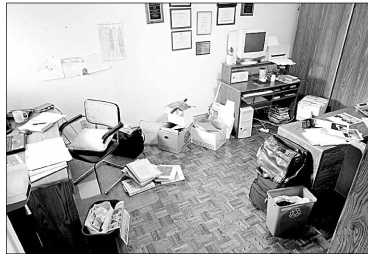
With a little time and a few simple steps, a clutter-free area can be achieved.

important moments or events, fear of being without something you may need someday, and fear of being wasteful. Most pack rats are likely to have one dominant worry, so addressing it head-on can lead to big changes. It may be hard to transform yourself from a pack rat to a streamlined operator overnight, but these pointers should help you get in the habit of letting go.