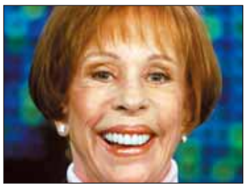
Carol Burnett, pictured in December on "Larry King Live," has a role on "Desperate Housewives."

Burnett is a fan of ABC's hit suburban satire — she calls a scene in which Eva Longoria's character famously did yard