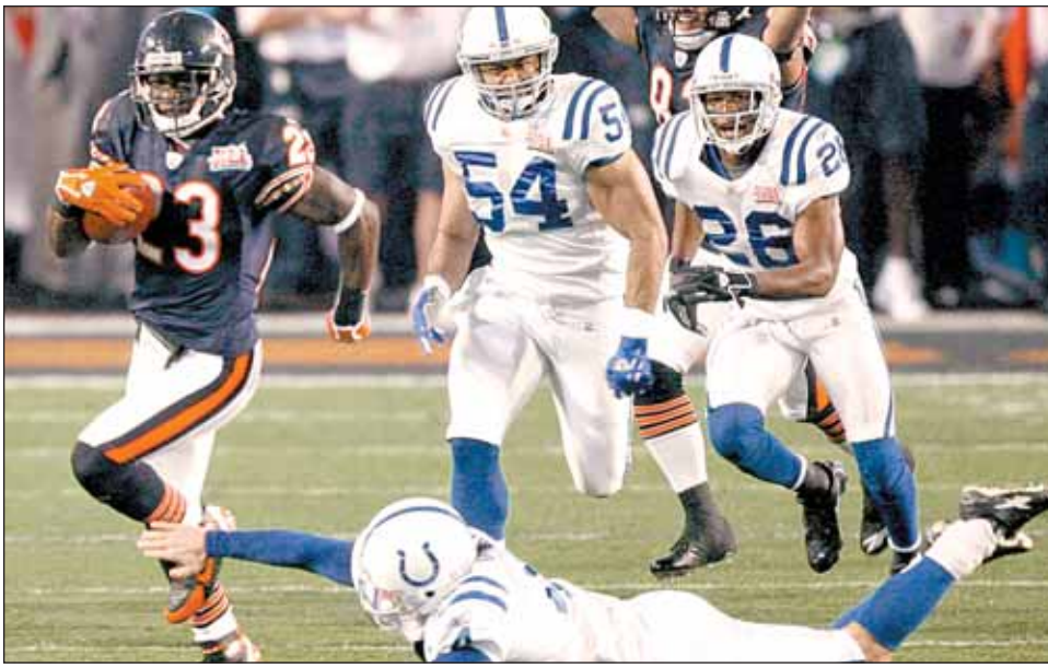
Left: Devin Hester returned the opening kickoff 92 yards for a touchdown, the first time an opening kick had been returned for a score in Super Bowl history. After an extra point, the Bears led 7-0 less than 30 seconds into the game.