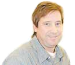
MORWICK IN MIAMI