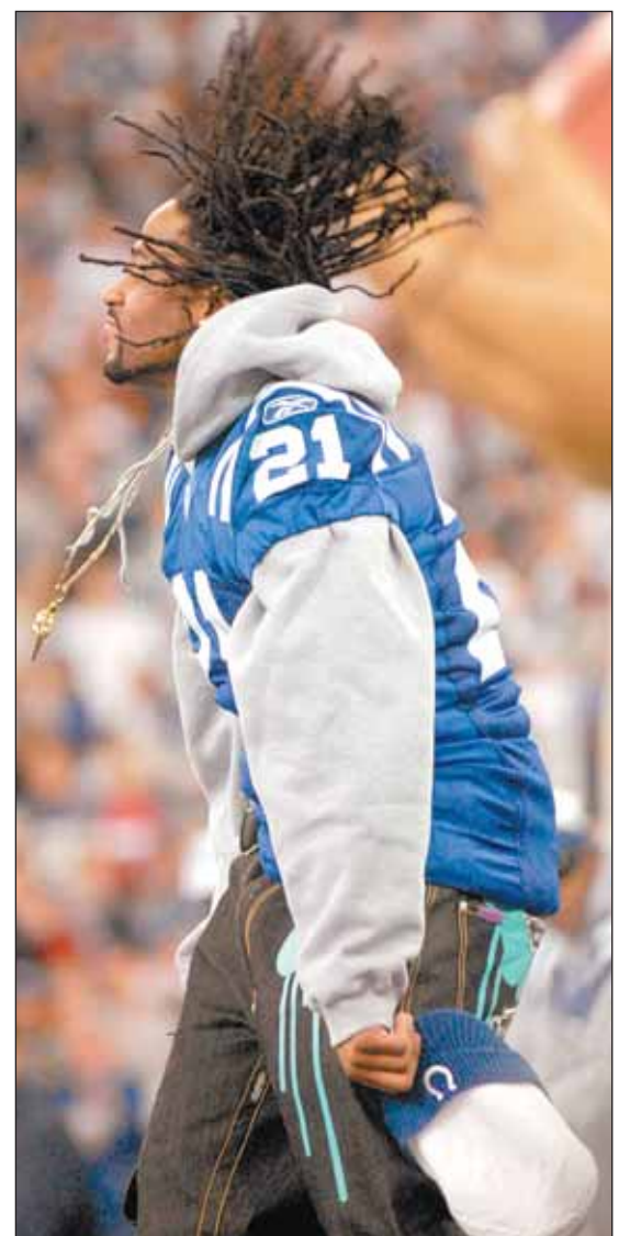
From left, quarterback Peyton Manning gives a thumbs-up, coach Tony Dungy hoists the Lombardi Trophy, and safety Bob Sanders shakes his dreadlocks during a rally to celebrate the Indianapolis Colts' Super Bowl championship at the RCA Dome on Monday. At top, players and team officials acknowledge the crowd before the start of the rally, which attracted an estimated 40,000 fans to the home of the Colts.