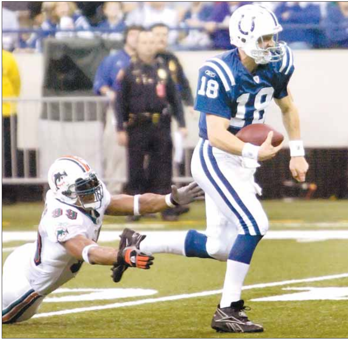
Colts quarterback Peyton Manning, right, evades Miami Dolphins defensive end Jason Taylor on an 11-yard touchdown run during Sunday's game in Indianapolis. The Colts will host Kansas City in an AFC wild-card game Saturday.