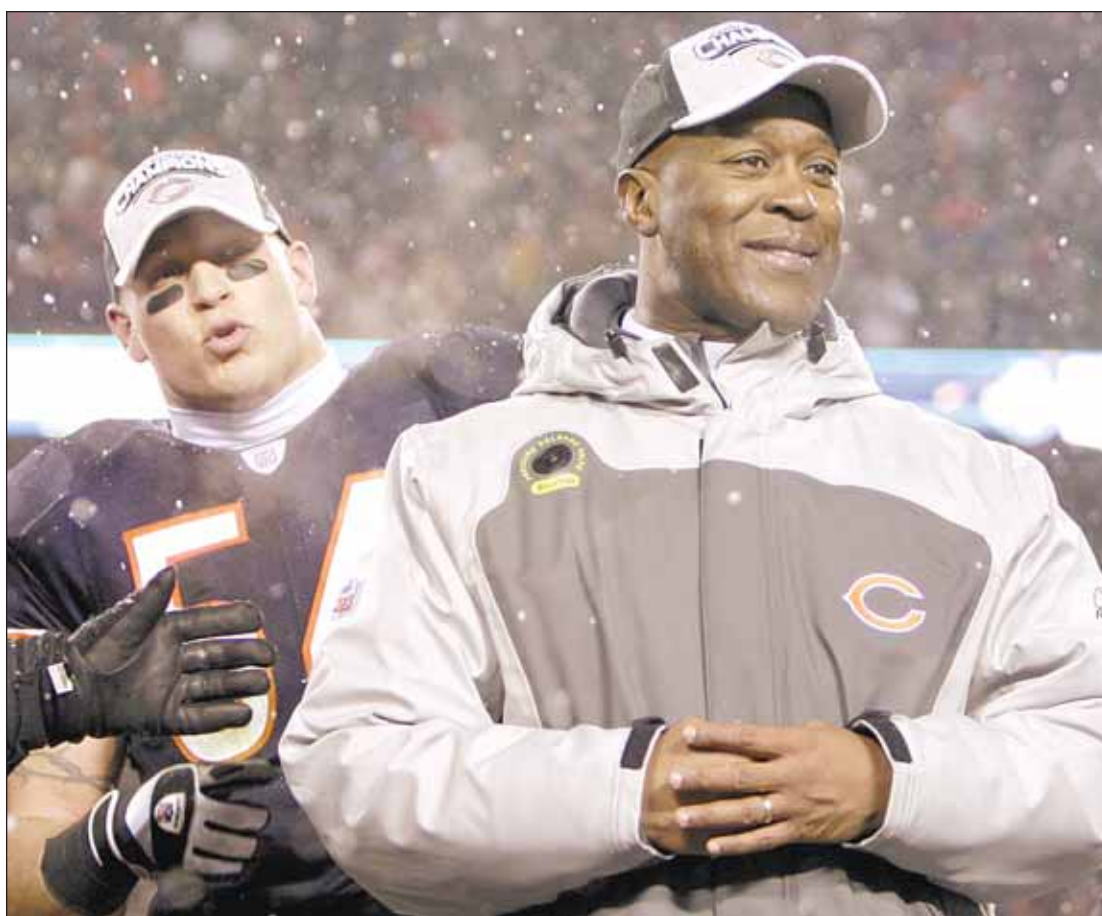
Bears coach Lovie Smith, right, and linebacker Brian Urlacher await the trophy presentation after Chicago defeated the New Orleans Saints in the NFC title game Sunday. Smith is making his first trip to the Super Bowl.

He quickly proved he could coach. As the years went by, though, he realized what a strange equation the NFL had when it came to race.