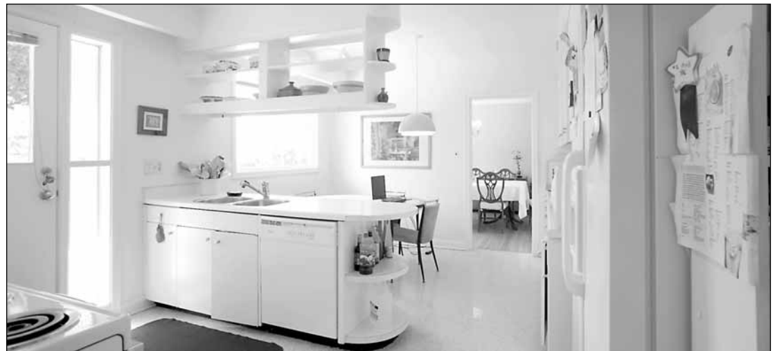
This kitchen was short on functionality. Since it contained an eat-in area, only half of the room was usable for prep space.

The newly designed kitchen has updated patterns and style. The wall between the kitchen and dining area was removed to allow the open kitchen-dining room concept that is popular with today's homeowners.